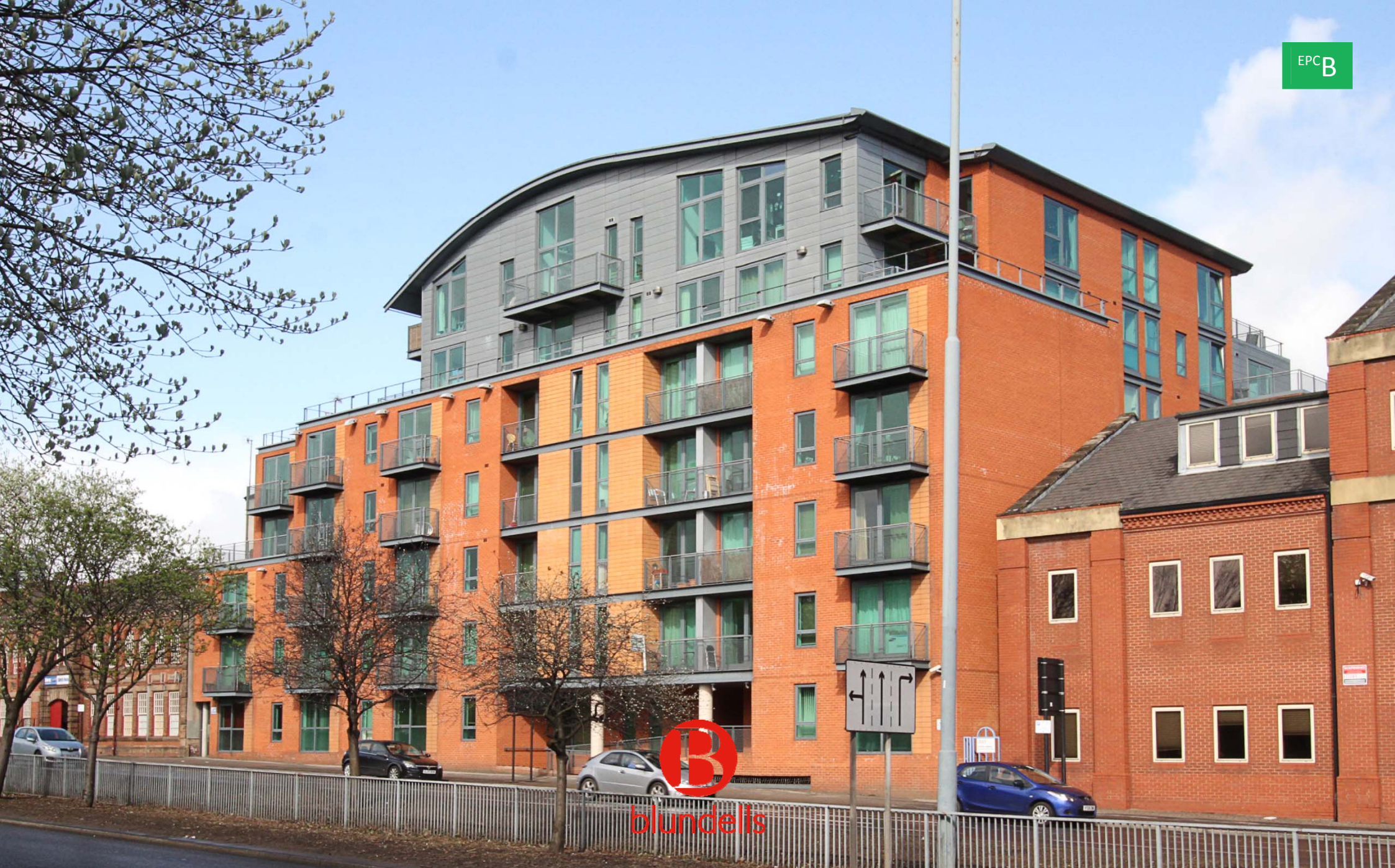
Jet Centro, 79 St. Marys Road, Sheffield, South Yorkshire, S2 4AU