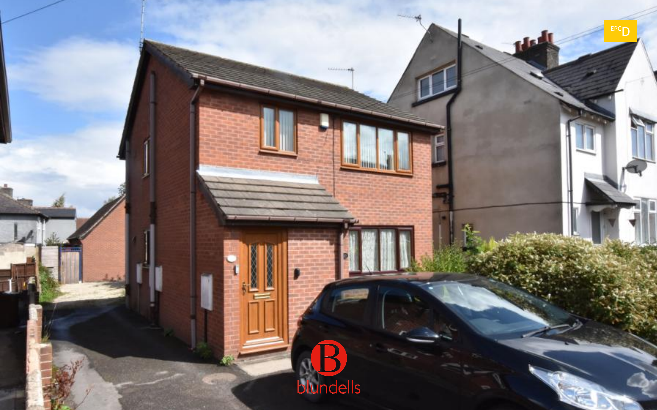
Mortomley Lane, High Green, Sheffield, South Yorkshire, S35 3HT