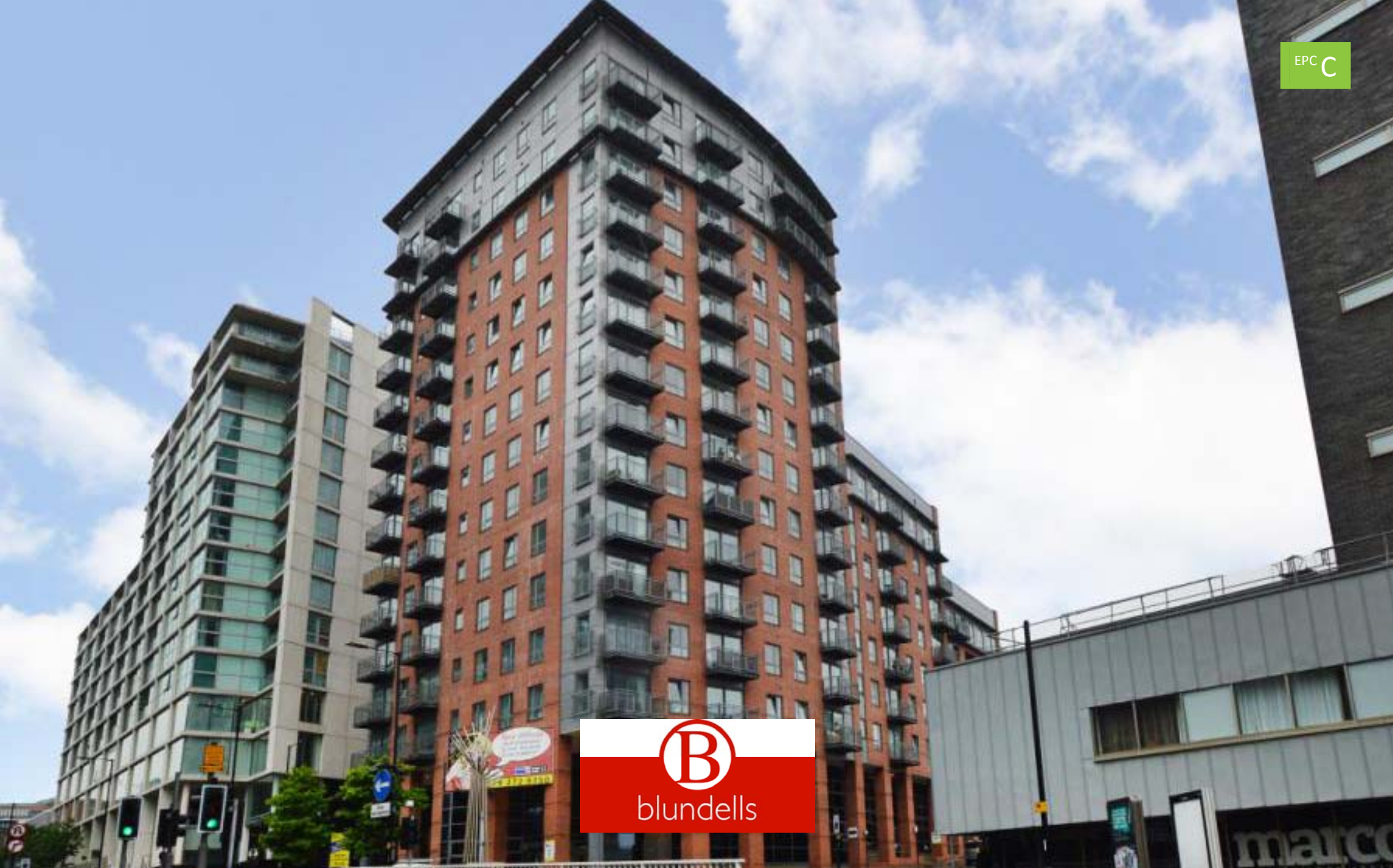
Metis, 1 Scotland Street, Sheffield, South Yorkshire, S3 7AT