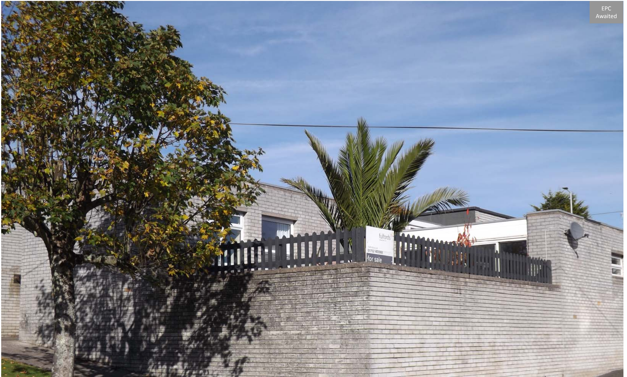
Stamford Close, Plymouth, Devon, PL9 9SG Asking Price £170,000