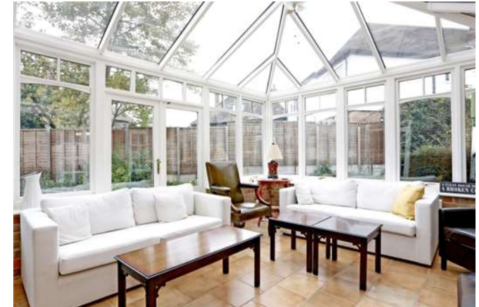
Hollycroft 136489 Ph 10