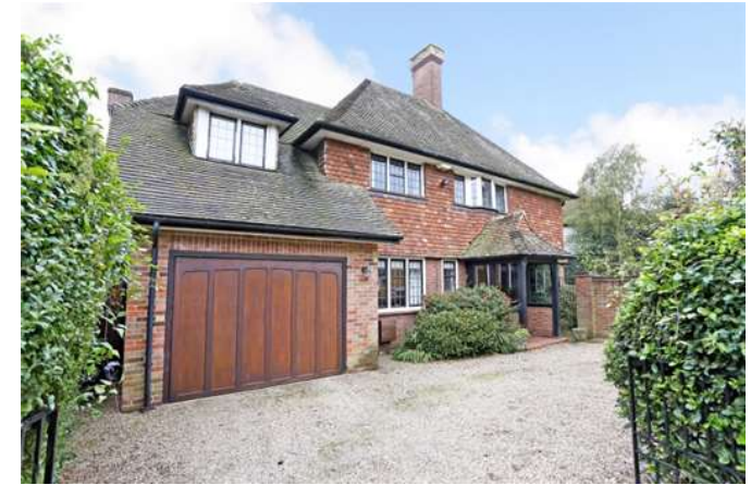
Hollycroft 136489 Ph 1