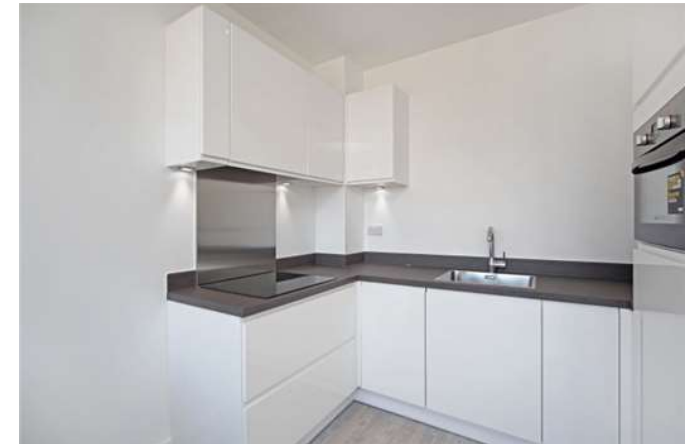
8 Portland House 143792 (5)