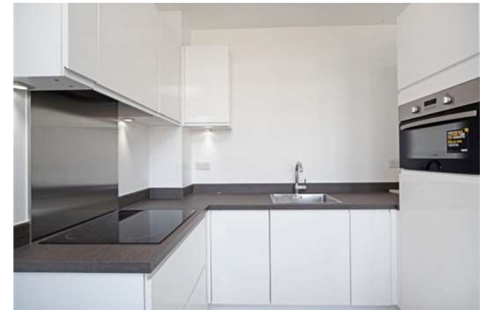
8 Portland House 143792 (6)