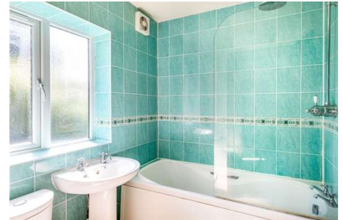
Thrupny-Bit House fpz214367(12)