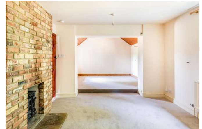
Thrupny-Bit House fpz214367(14)