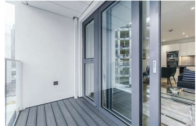
Nine Elms Point