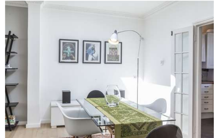
St Georges Square