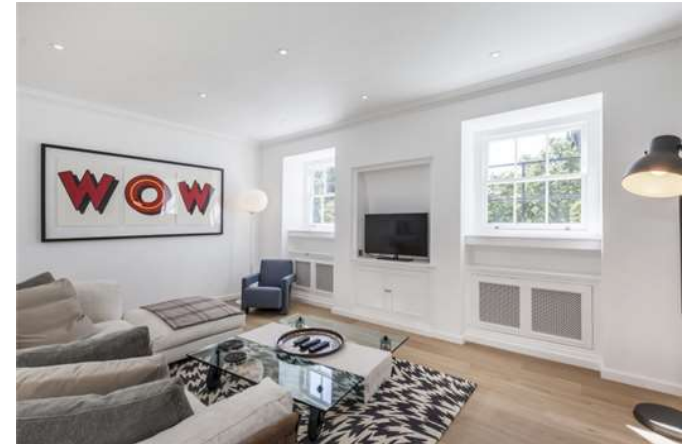
St Georges Square