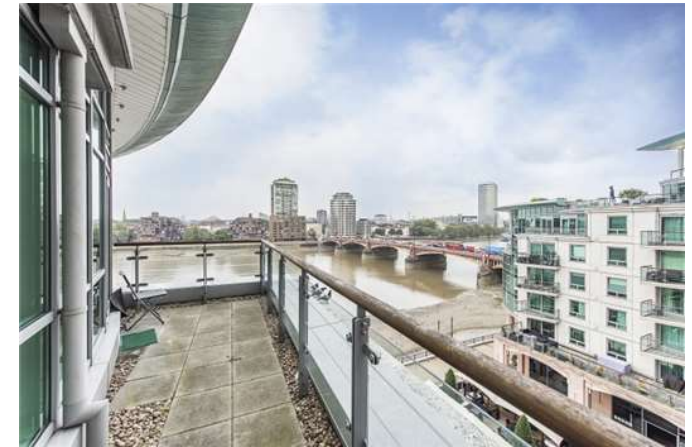
Flagstaff House (2)