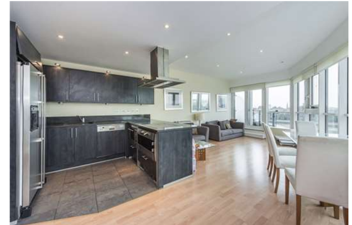
Flagstaff House (8)