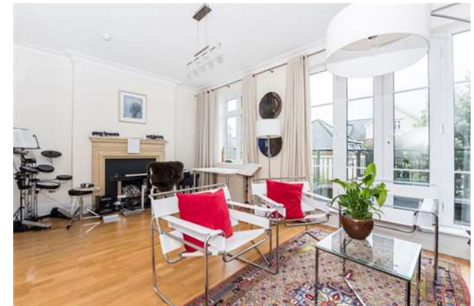
Reception Room -2