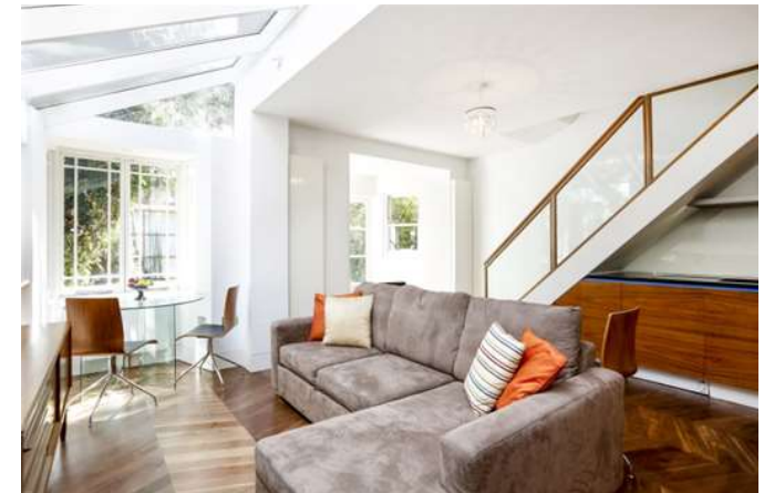
Reception room 3