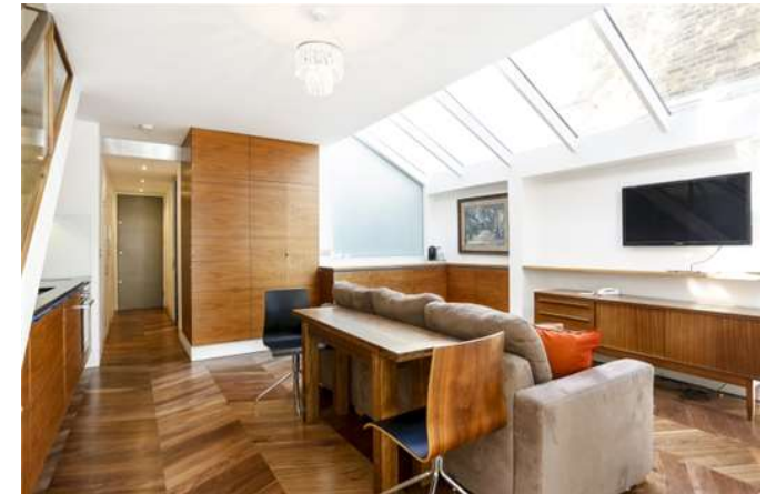
Reception room 2