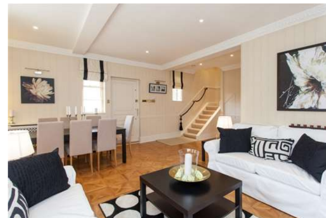
Reception dining area