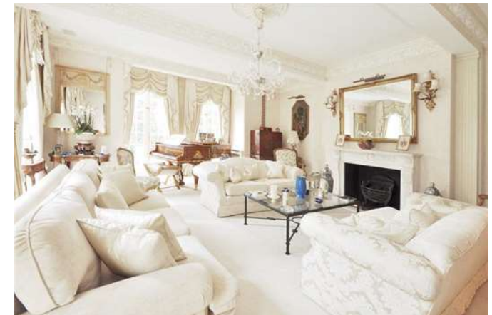
Reception Room 1