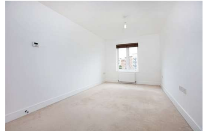
Burghley Court fpz175304 (7)