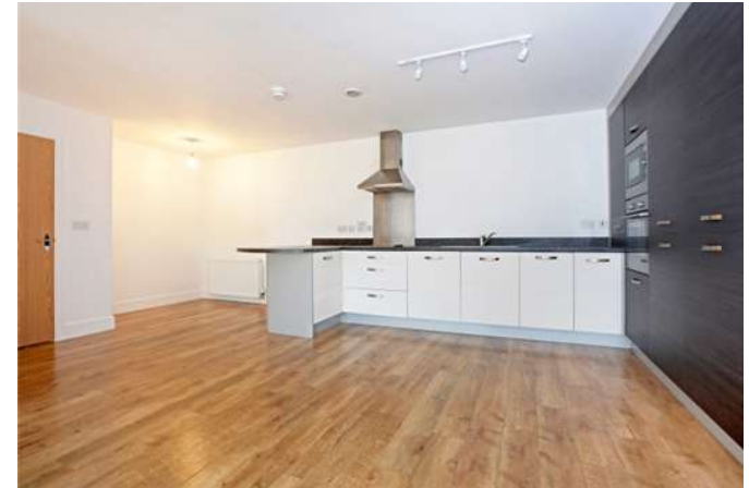
Burghley Court fpz175304 (11)