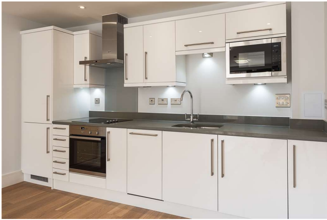
Open Plan Kitchen