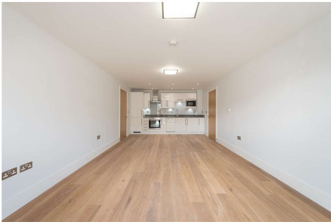
Open Plan Reception