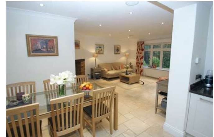
Breakfast area through to family room