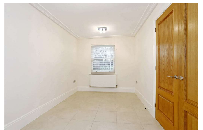
7a North Drive 139332 Ph 13