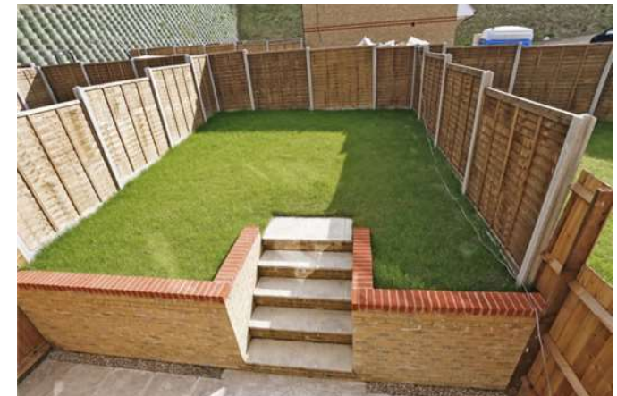
158 Kingsmead Road 167390 (5)