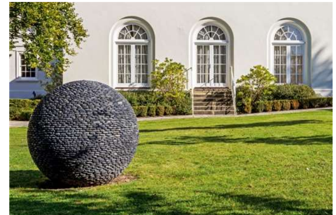
2 Thirlestaine Hall fpz196937 (8)