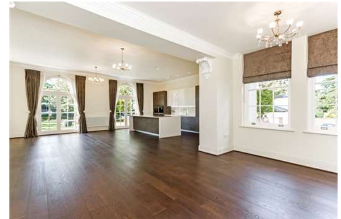
2 Thirlestaine Hall fpz196937 (10)

with concealed extractor adjacent. There is a laundry room off the hall with space for washing machine and tumble drier; cloakroom; store cupboard. The second double bedroom suite has an en-suite dressing room with hanging rail, shelving and drawers and en-suite shower room. The third double bedroom has The third double bedroom has two large sash windows and a range of built-in wardrobes and en-suite shower room.