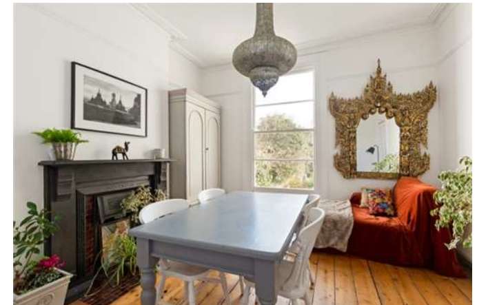
18 College fpz201393 (11)