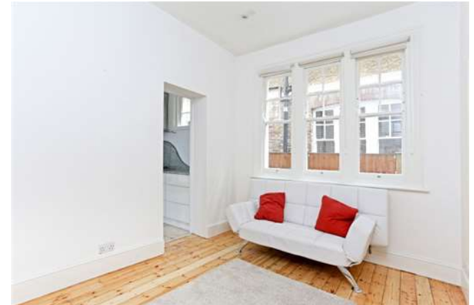
Second Reception Room