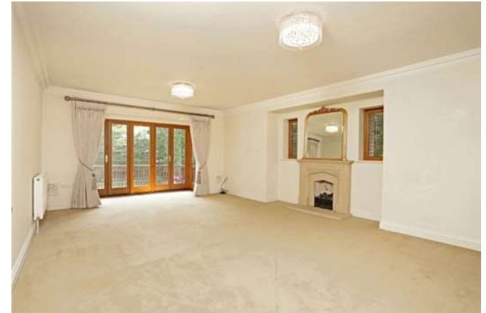
Springfield fpz170915 (9)