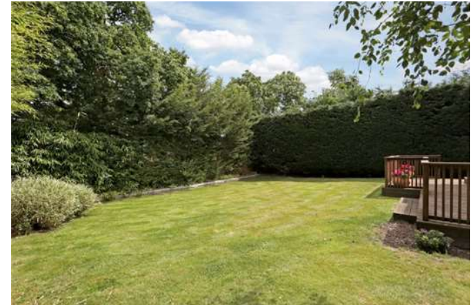
Springfield fpz170915 (19)