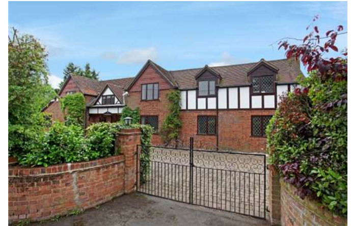
Oakley Cottage fpz168572 (26)