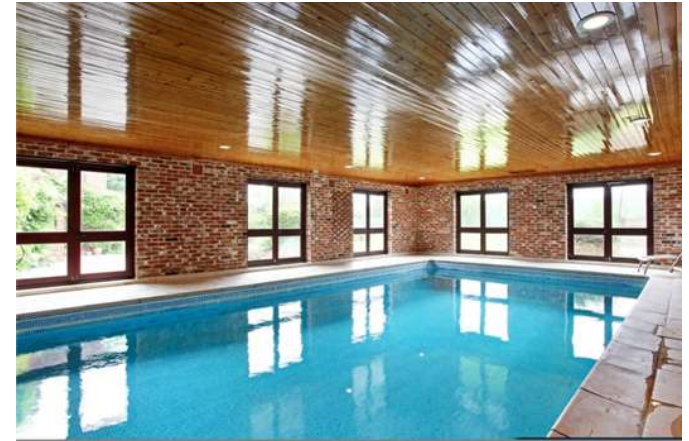
Oakley Cottage fpz168572 (21)