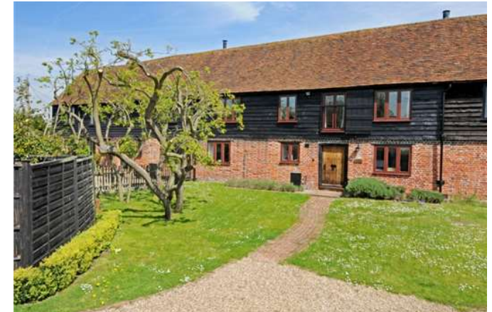
Middle Barton fpz 165945 (9)