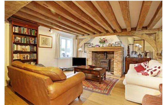
Middle Barton fpz162383 (10)