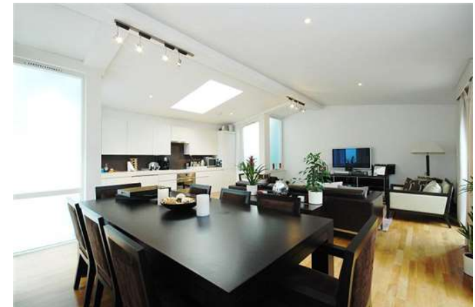
Open Plan Reception