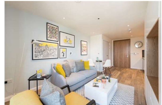
Living Room/Dining Area