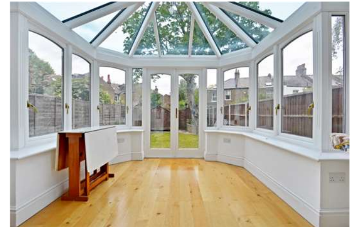
Pickwick Road 148073 (13)

Pickwick Road is located just off the beautiful Dulwich Village. North Dulwich station provides routes to London Bridge and bus routes are available towards Herne Hill (National Rail to Blackfriars) and Brixton (Victoria Line).