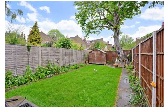
Pickwick Road 147409 (1)