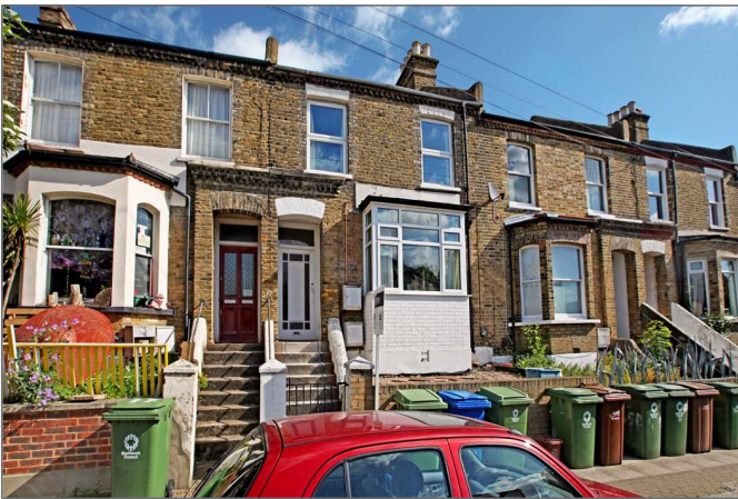
Soames Street 147810 ph07straight