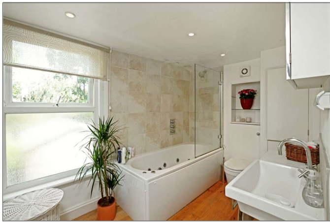
Soames Street 147810 ph01