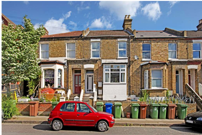
Soames Street 147810 ph11straight