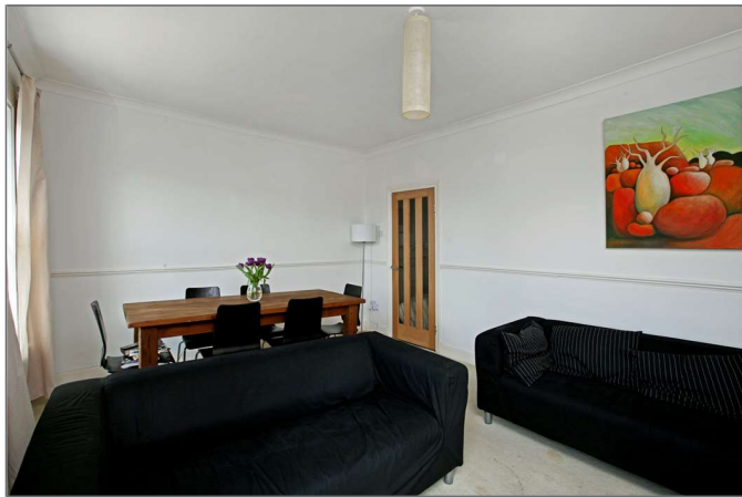
Soames Street 147810 ph06