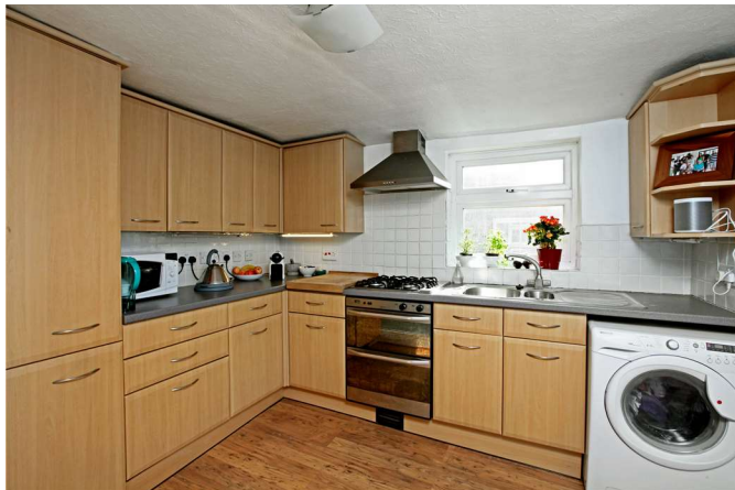
Soames Street 147810 ph02