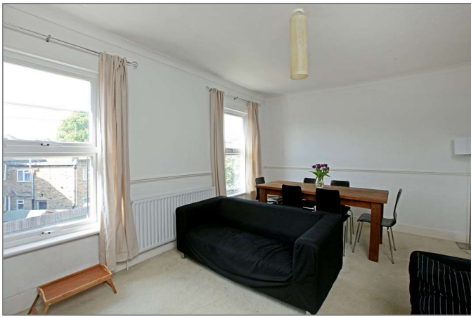
Soames Street 147810 ph05