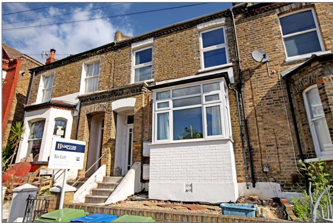
Soames Street 147810 ph08