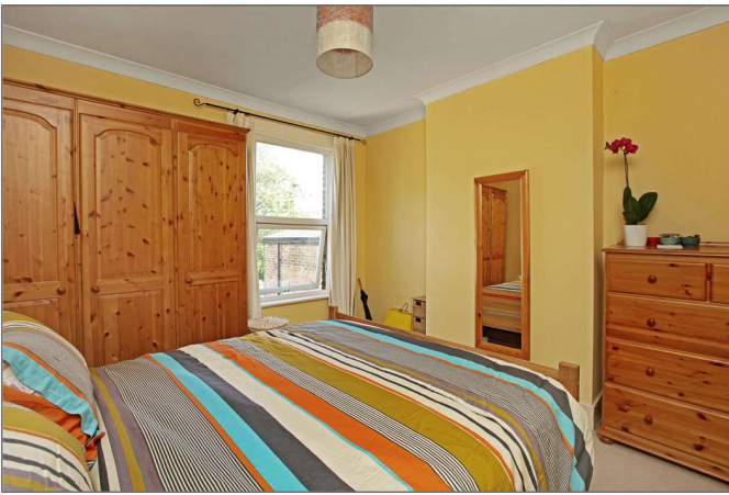
Soames Street 147810 ph03