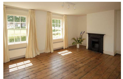
049 - master bedroom