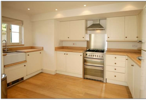
049 - kitchen