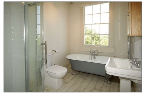
049 - bathroom