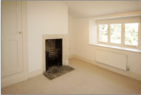
012 - bed 2