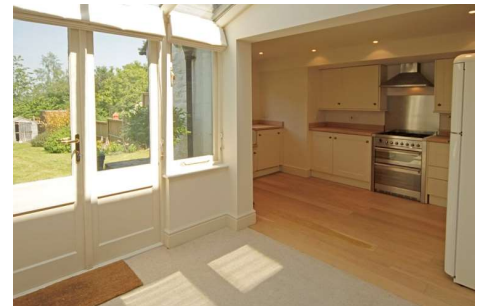
049 - kitchen diner