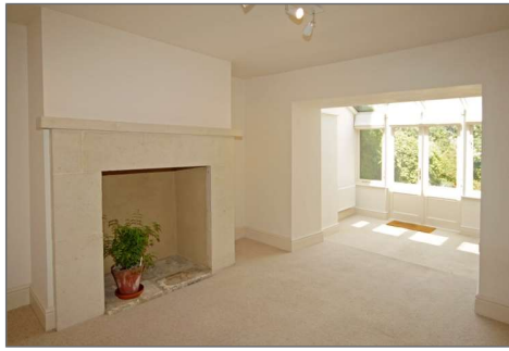
049 - sitting room