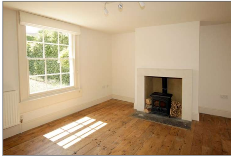
049 living room