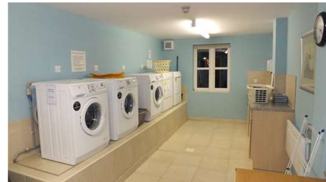
Communal laundry room