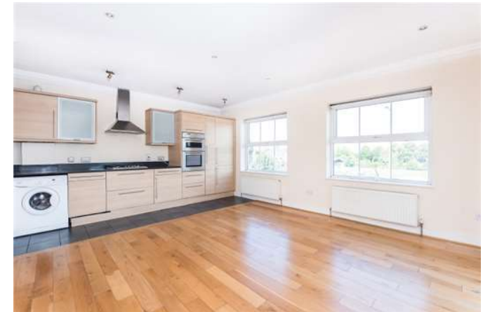
Open Plan Kitchen/Living