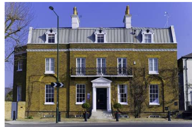
External Vantage Point