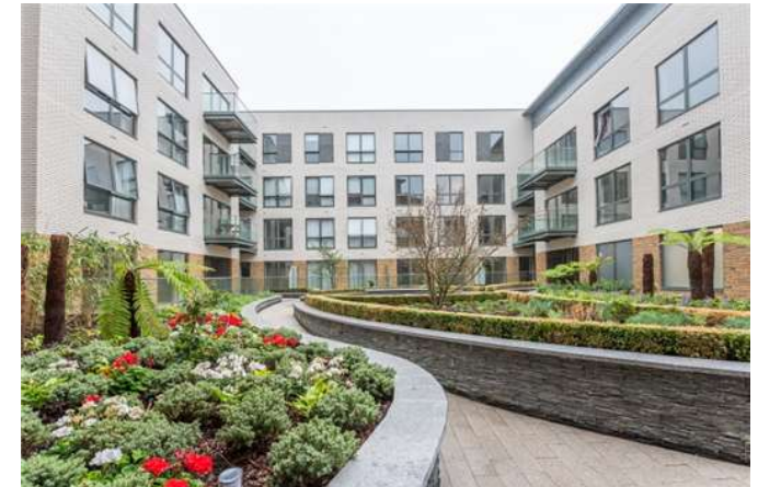
External vantage point

Located in the new Brewery Wharf development,