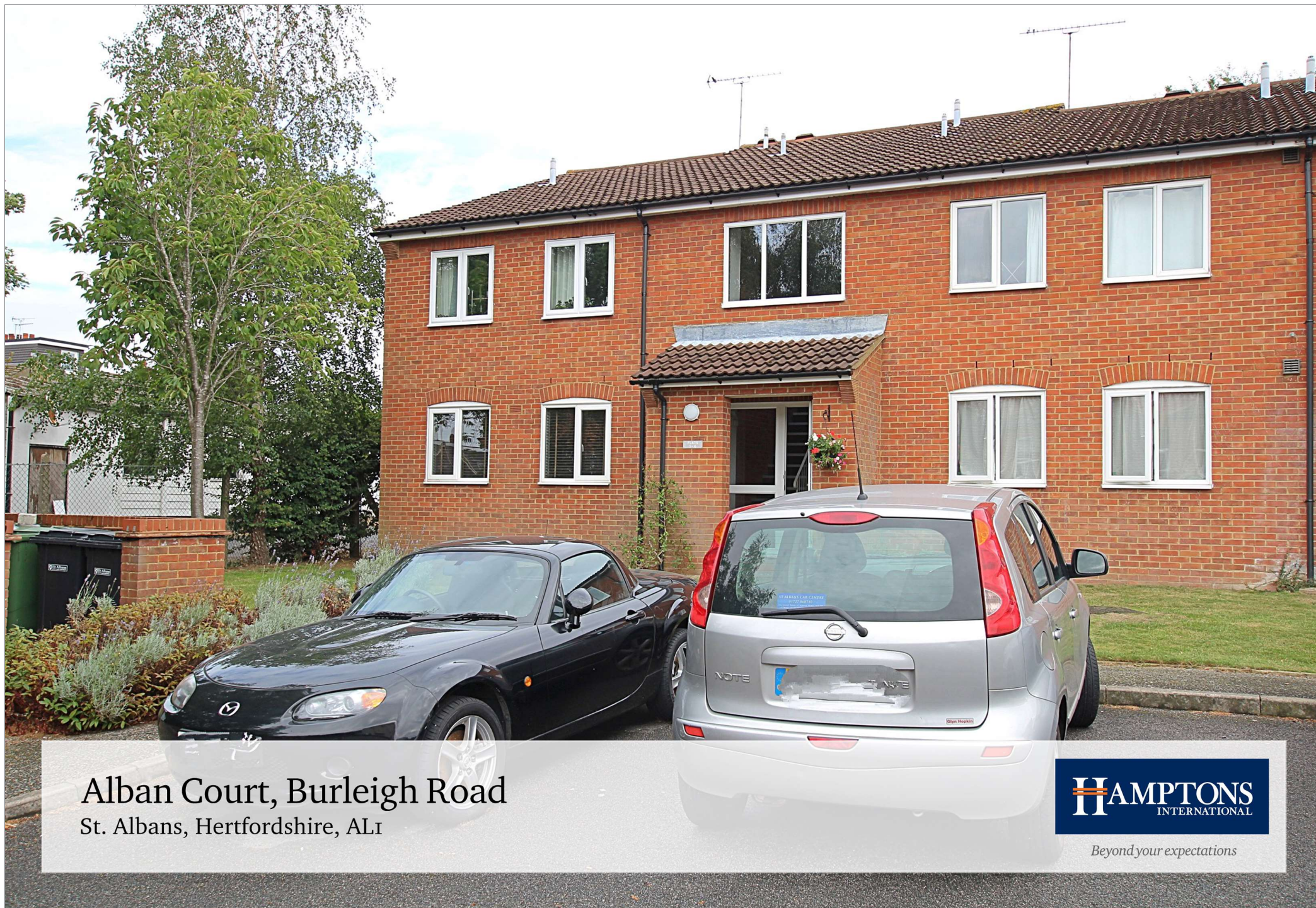
Alban Court, Burleigh Road St. Albans, Hertfordshire, AL1