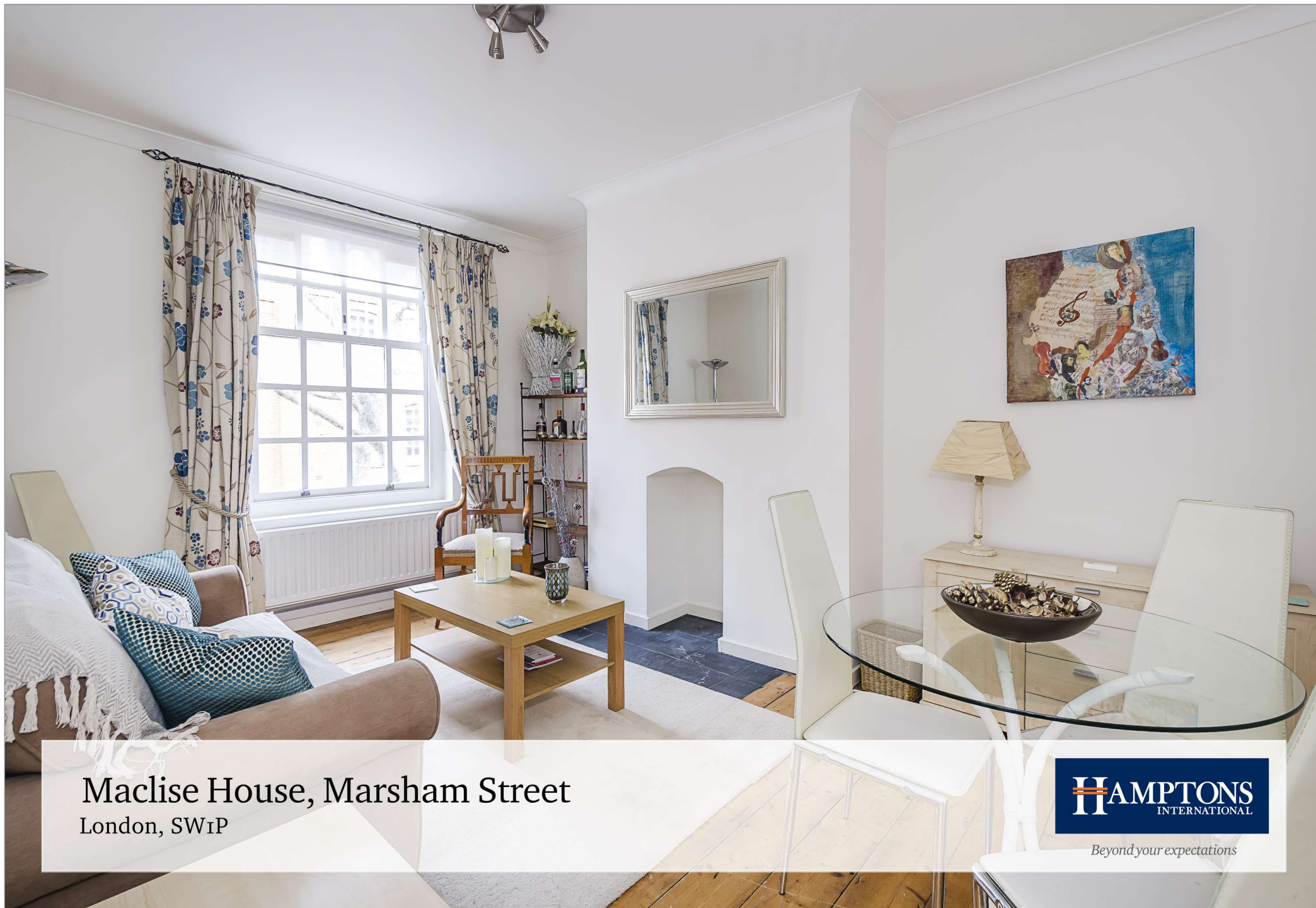
Maclise House, Marsham Street London, SW1P