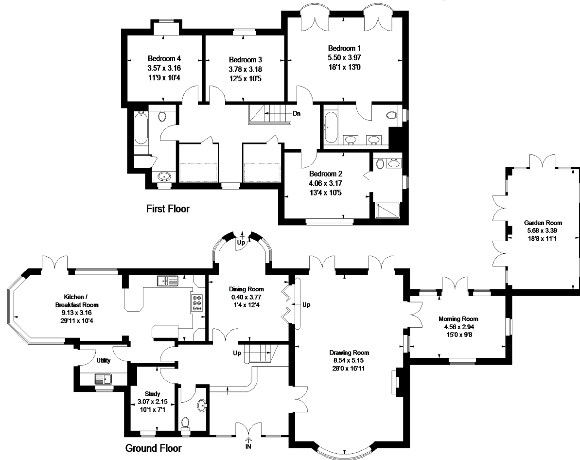
Illustration For Identification Purposes Only. Not To Scale Ref 127831

FOR CLARIFICATION We wish to inform prospective purchasers that we have prepared these sales particulars as a general guide. We have not carried out a detailed survey, nor tested the services, appliances and specific fittings. Room sizes are approximate and rounded: they are taken between internal wall surfaces and therefore include cupboards/shelves, etc. Accordingly, they should not be relied upon for carpets and furnishings. Formal notice is also given that all fixtures and fittings, carpeting, curtains/blinds and kitchen equipment, whether fitted or not, are deemed removable by the vendor unless specifically itemised within these particulars.