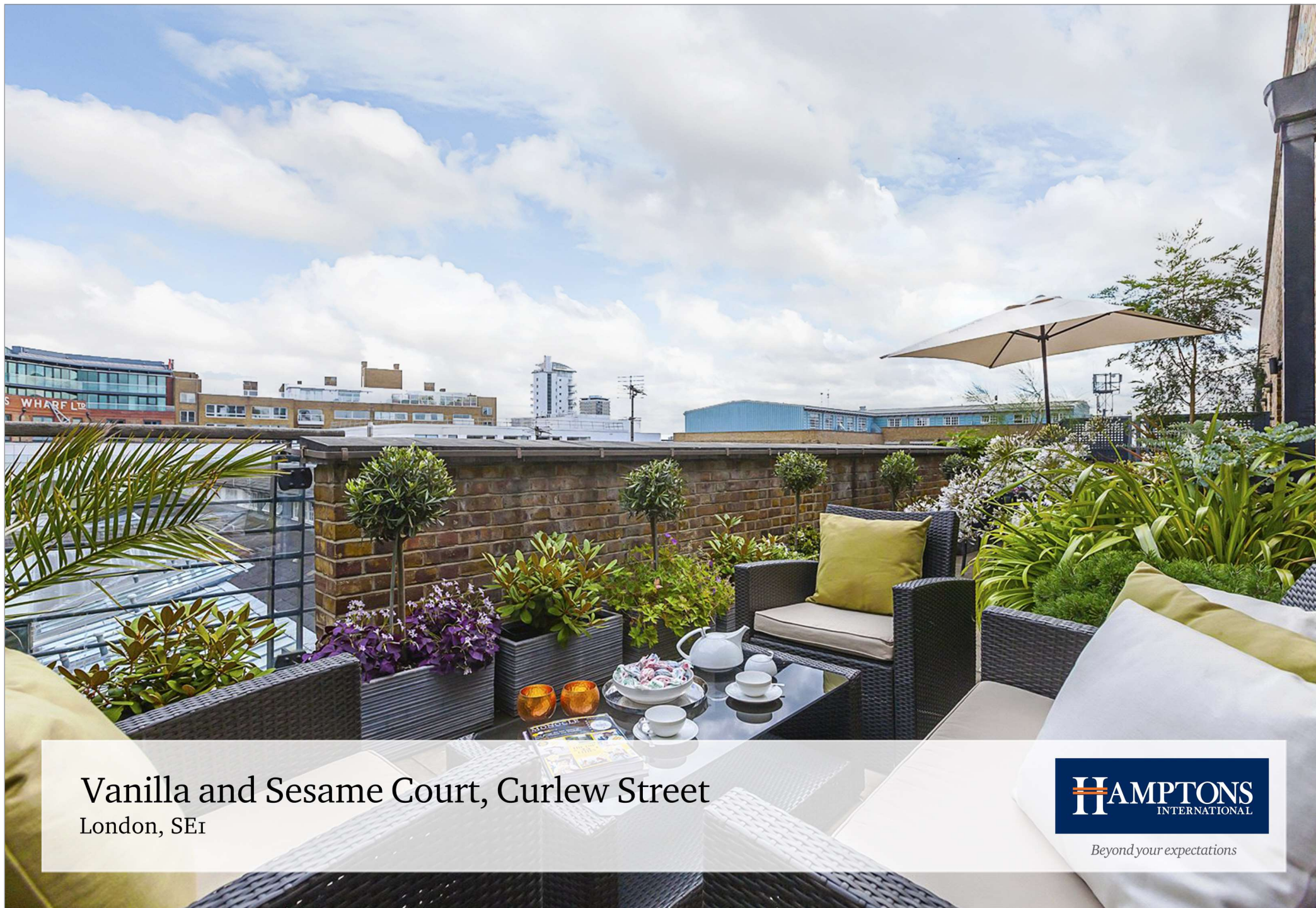
Vanilla and Sesame Court, Curlew Street London, SE1