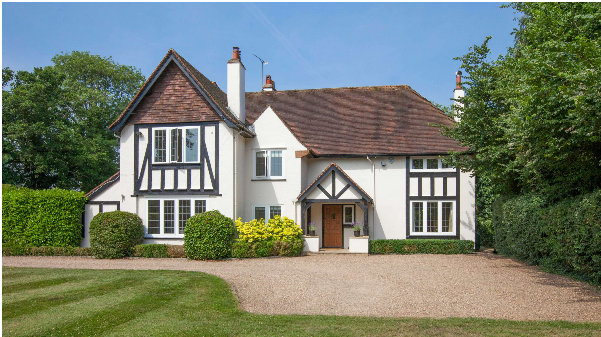
Green Lane, Burnham Bucks, SL1